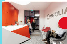
HEAD OFFICE - PAÇO DE ARCOS