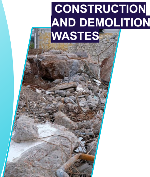
CONSTRUCTION AND DEMOLITION WASTES