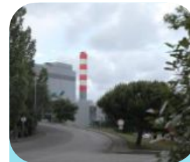
Portugal Waste-to -energy