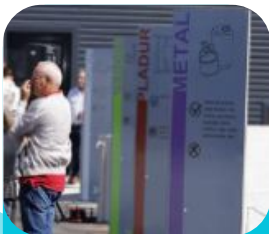
Portugal Recycling Center