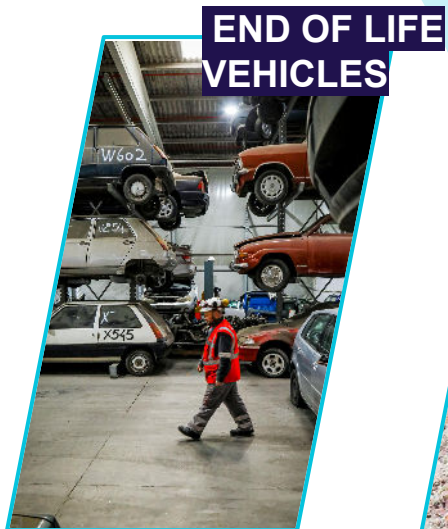
END OF LIFE VEHICLES