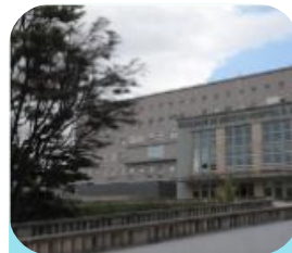
Portugal Energy services in a hospital environment