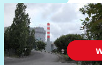
WASTE-TO-ENERGY (GREATER PORTO)

We are present from north to south and the Azores, with a structure of human and technical resources that guarantee a fast response.