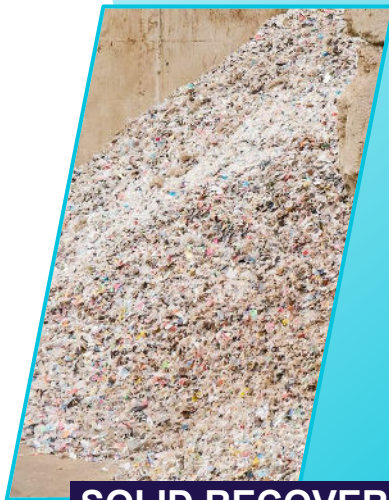
SOLID RECOVERED FUEL