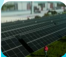
Portugal Photovoltaic solar energy in large buildings