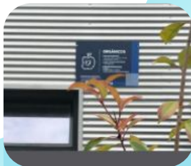
Portugal Industrial and commercial waste management